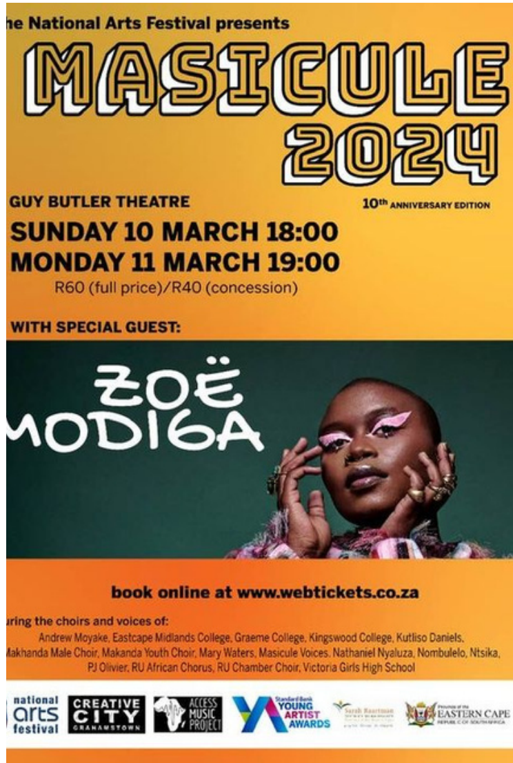
Left: The senior choir will be performing at the Masicule Choir spectacular on Sunday 10 March and Monday 11 March. We wish them all the best!