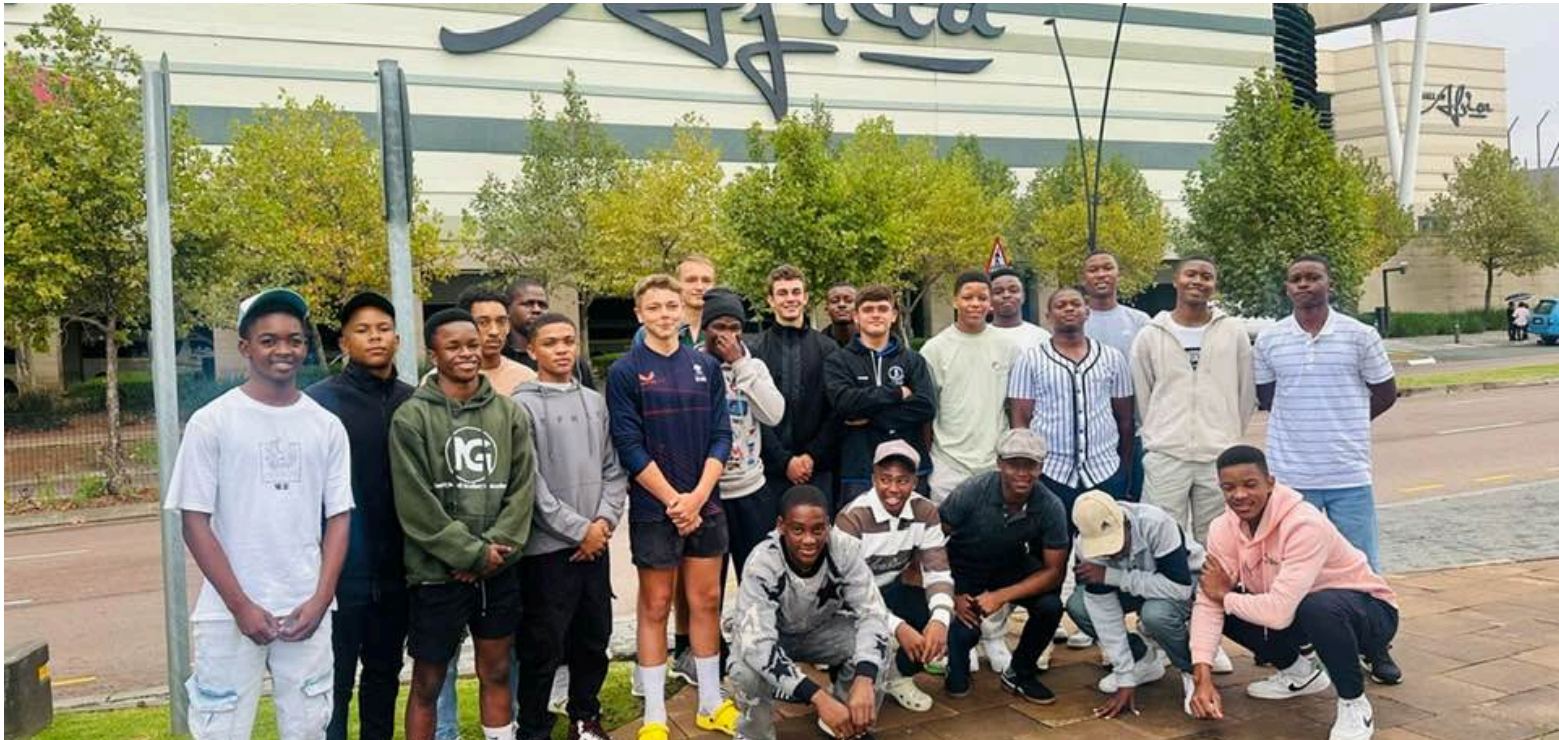
U16As wearing their stunning tour jerseys - our thanks to sponsors Summerpride and Muir Transport. #muirtrans

SHOPPING! It's definitely a different experience compared to shopping in Makhanda Our U16 A-boys are having a blast enjoying a well-deserved day off at the largest mall in South Africa. With the help of some amazing fundraising efforts, they've each got a player's allowance to make the most of their time here! It's not just about the shopping – it's about creating memories!